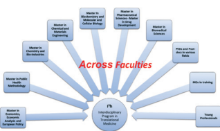
Figure 1: Background education of the participants in the interdisciplinary educational program

> Reported added value of the interdisciplinary education: The students' feedback was unambiguously positive. Several of them stated that they acquired valuable knowledge, that they learned so much from working in interdisciplinary teams and at the intersection of disciplines and would recommend colleagues to attend the program.